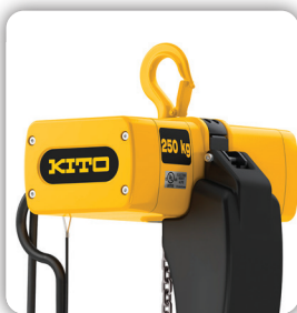
Top Hook Mount