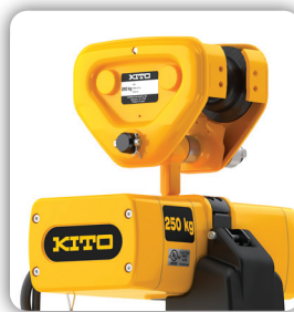
Plain Trolley Mount