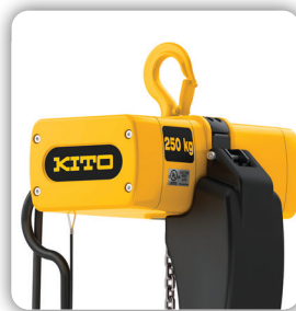
Top Hook Mount